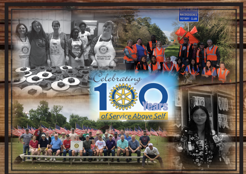
ROTARY CLUB OF NACOGDOCHES 2020-2021

Today our Nacogdoches Rotary Club is 179 members strong. Our club meets at noon every Wednesday at the Fredonia Hotel and Convention Center located at 200 North Fredonia Street. Our club is a large and diverse fellowship of inspired business, professional and civic leaders with significant community connections that foster the ideals of Service Above Self and the high ethical standards of The Four Way Test. Thank You Rotary for making a difference in communities around the globe!