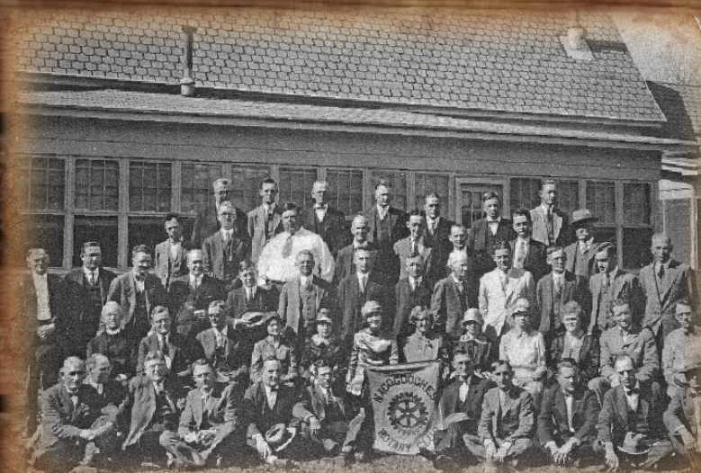
ROTARY CLUB OF NACOGDOCHES 1921