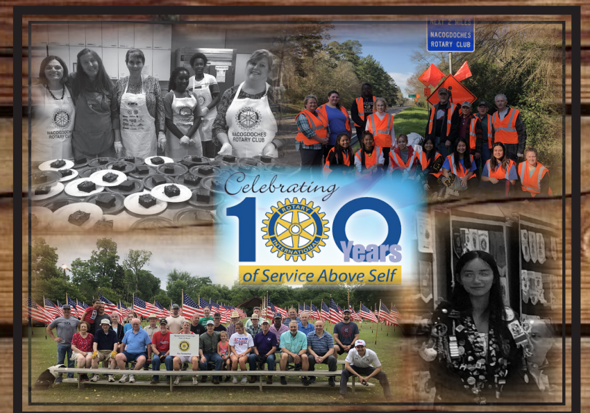
ROTARY CLUB OF NACOGDOCHES 2020-2021

Today our Nacogdoches Rotary Club is 179 members strong. Our club meets at noon every Wednesday at the Fredonia Hotel and Convention Center located at 200 North Fredonia Street. Our club is a large and diverse fellowship of inspired business, professional and civic leaders with significant community connections that foster the ideals of Service Above Self and the high ethical standards of The Four Way Test. Thank You Rotary for making a difference in communities around the globe!