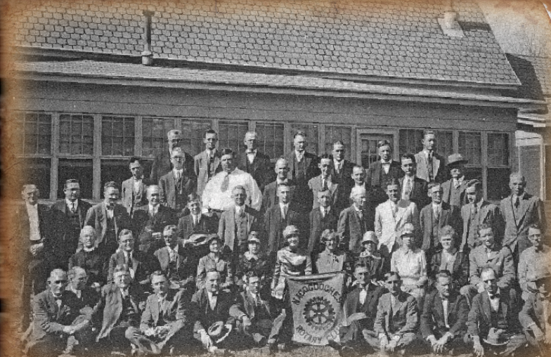
ROTARY CLUB OF NACOGDOCHES 1921