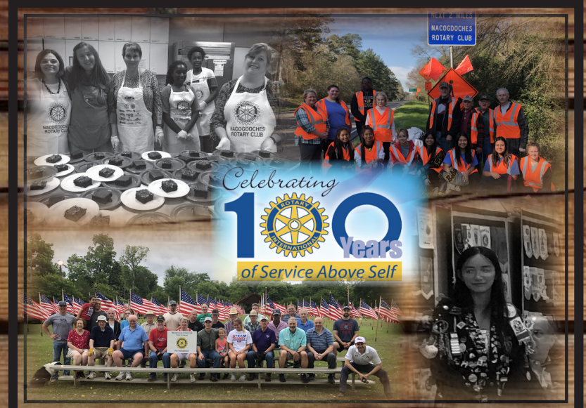
ROTARY CLUB OF NACOGDOCHES 2020-2021

Today our Nacogdoches Rotary Club is 179 members strong. Our club meets at noon every Wednesday at the Fredonia Hotel and Convention Center located at 200 North Fredonia Street. Our club is a large and diverse fellowship of inspired business, professional and civic leaders with significant community connections that foster the ideals of Service Above Self and the high ethical standards of The Four Way Test. Thank You Rotary for making a difference in communities around the globe!