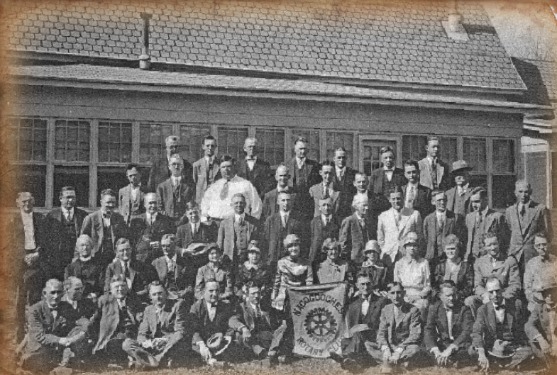
ROTARY CLUB OF NACOGDOCHES 1921