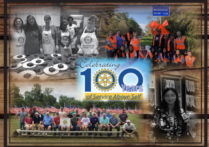
ROTARY CLUB OF NACOGDOCHES 2020-2021

Today our Nacogdoches Rotary Club is 179 members strong. Our club meets at noon every Wednesday at the Fredonia Hotel and Convention Center located at 200 North Fredonia Street. Our club is a large and diverse fellowship of inspired business, professional and civic leaders with significant community connections that foster the ideals of Service Above Self and the high ethical standards of The Four Way Test. Thank You Rotary for making a difference in communities around the globe!