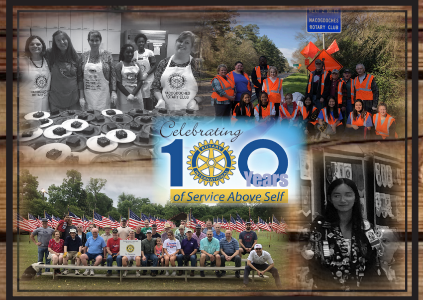
ROTARY CLUB OF NACOGDOCHES 2020-2021

Today our Nacogdoches Rotary Club is 179 members strong. Our club meets at noon every Wednesday at the Fredonia Hotel and Convention Center located at 200 North Fredonia Street. Our club is a large and diverse fellowship of inspired business, professional and civic leaders with significant community connections that foster the ideals of Service Above Self and the high ethical standards of The Four Way Test. Thank You Rotary for making a difference in communities around the globe!